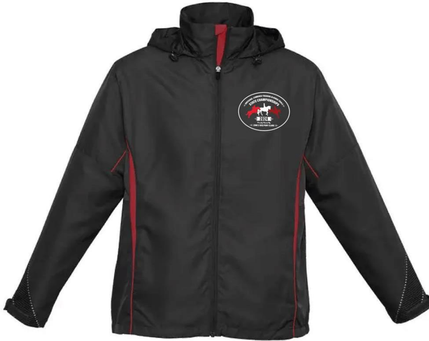
Kids Jacket (available in Black/Red) Child sizes 4/6-14 available $60 each