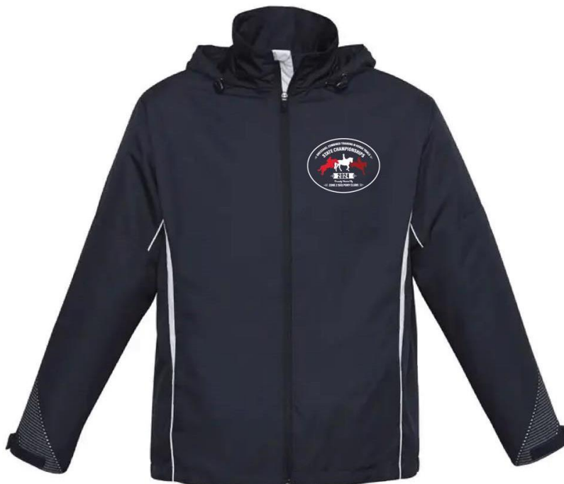
Adult Jacket (available in Black/Grey) Adult sizes S-3XL available $65 each