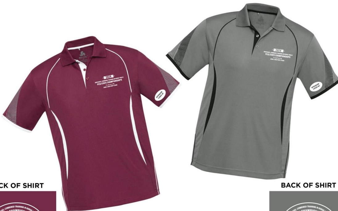
BACK OF SHIRT