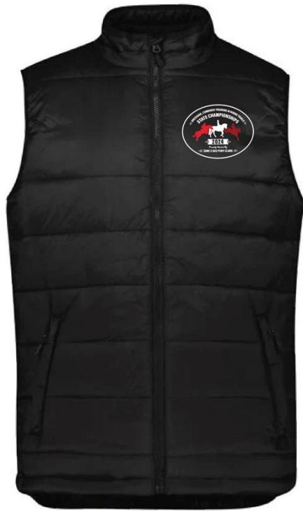
Vest (available in Black) Adult sizes XS-3XL available $60 each