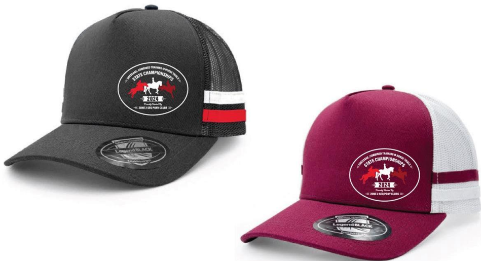
Caps (available in Gray or Maroon) One size fits most $30 each